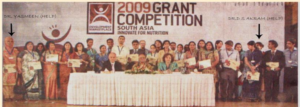
Grant recipients pose with Finance Minister AMA Muhith at a programme at Bangabandhu International Conference Centre yesterday.